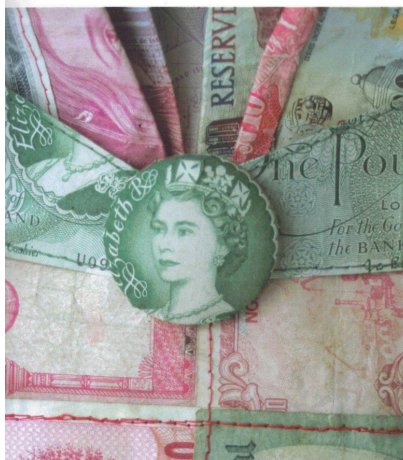
Money Dress (detail) 2010 Paper money notes, cotton thread, frame Courtesy the artist